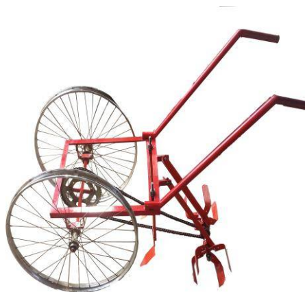
Figure: 1 Double wheel weeder

This model is designed to fulfil the present requirements (shown in fig1) and plate is designed as( shown in table1).The chain sprocket mechanism is used in this model for increasing the speed ratio.